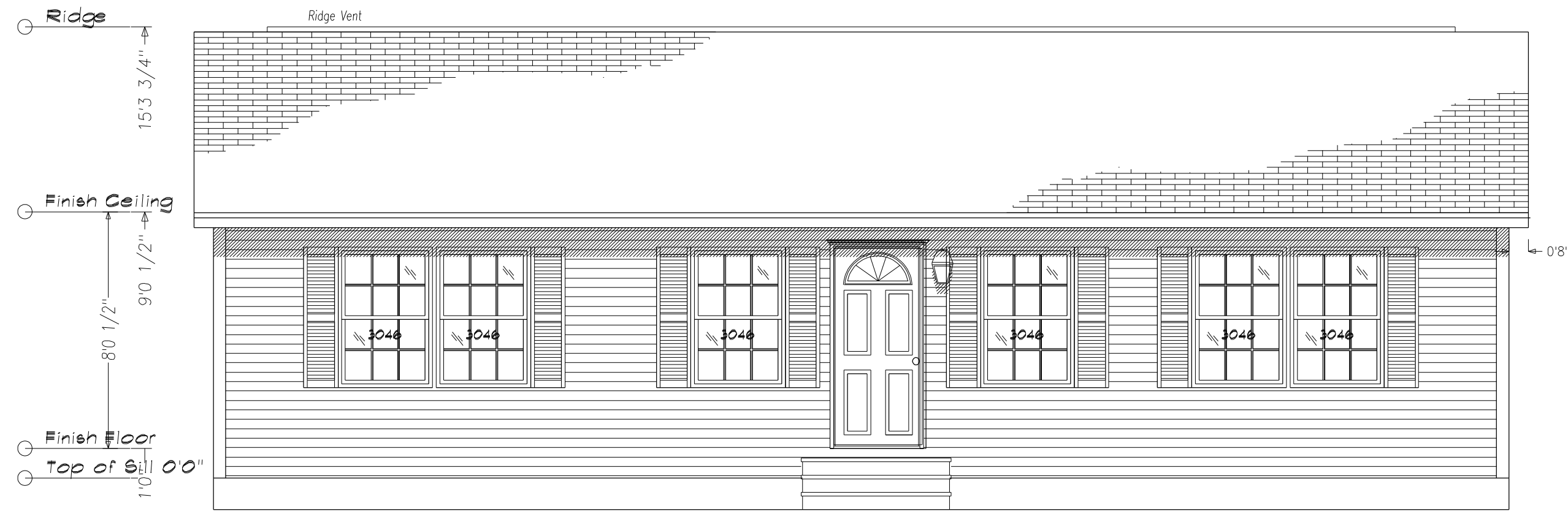
Front Elevation Scale: 1/4" = 1'0"

All kneewall framing & sheathing by GC Gable End Overhangs - Optional on all Style Homes