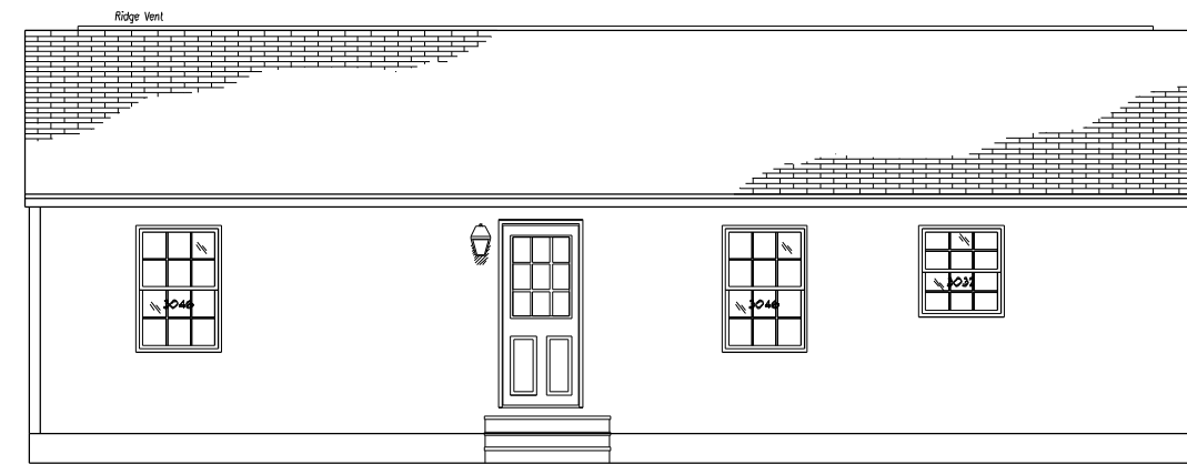
Rear Elevation Scale: 1/8" = 1'0"