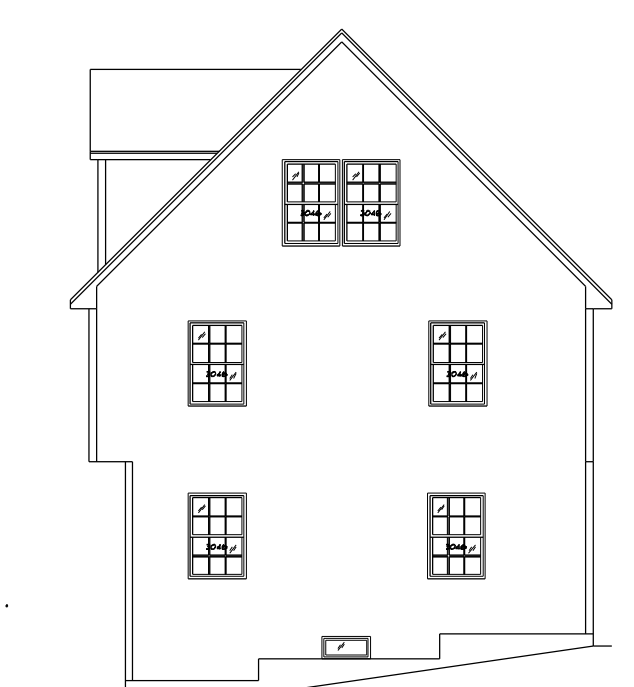
Right Elevation Scale: 3/32" = 1'0"