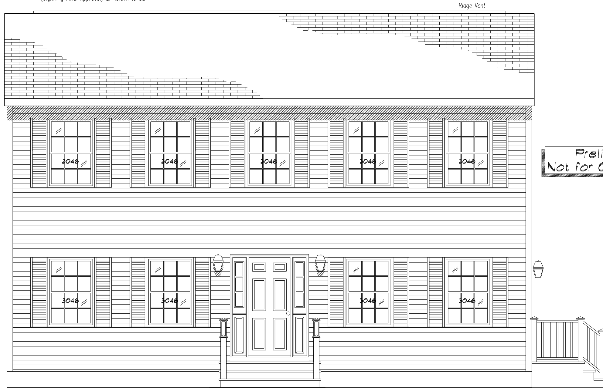
Front Elevation Scale: 1/4" = 1'0"