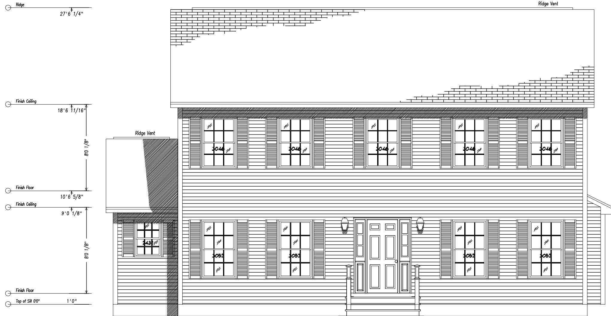
Front Elevation Scale: 3/16" = 1'0"

NOTE: Architectural details shown may not be included as standard in order as priced Garages, Decks, Railings, Exterior Stairs are all optional for all homes. Window Shutters - Optional on all Homes Overhead Doors - Not Available from CSI Window Grills - Option Kneewall Window & Siding Packages are optional (Split Level, Tri Level) All kneewall framing & sheathing by GC