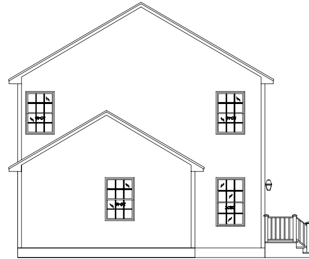
Left Elevation Scale: 3/32" = 1'0"

NOTE: Architectural details shown may not be included as standard in order as priced Garages, Decks, Railings, Exterior Stairs are all optional for all homes. Window Shutters - Optional on all Homes Overhead Doors - Not Available from CSI Window Grills - Option Kneewall Window & Siding Packages are optional (Split Level, Tri Level) All kneewall framing & sheathing by GC