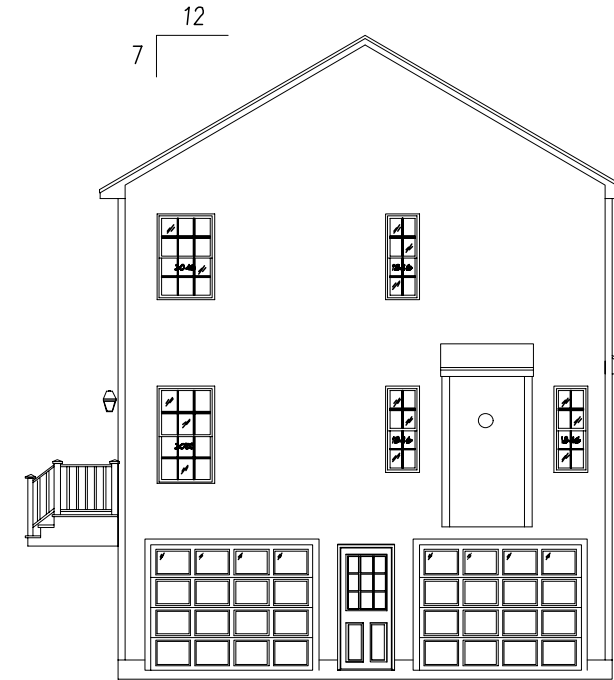
Right Elevation Scale: 3/32" = 1'0"