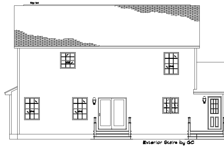
Rear Elevation Scale: 3/32" = 1'0"