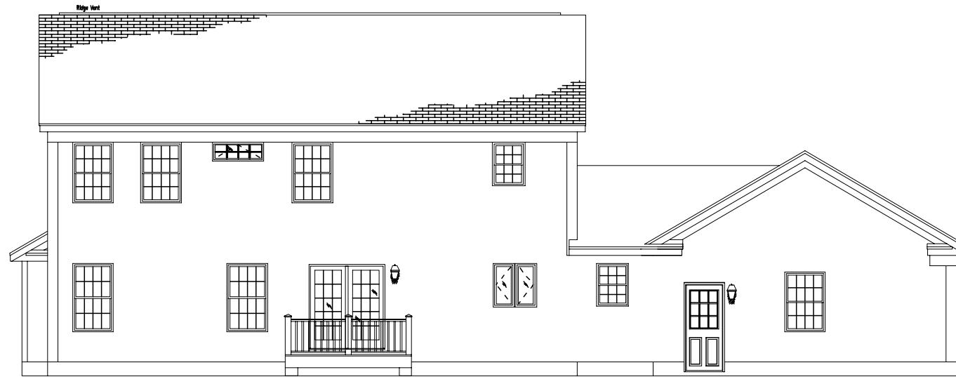
Rear Elevation Scale: 3/32" = 1'0"