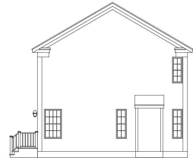
Right Elevation Scale: 3/32" = 1'0"