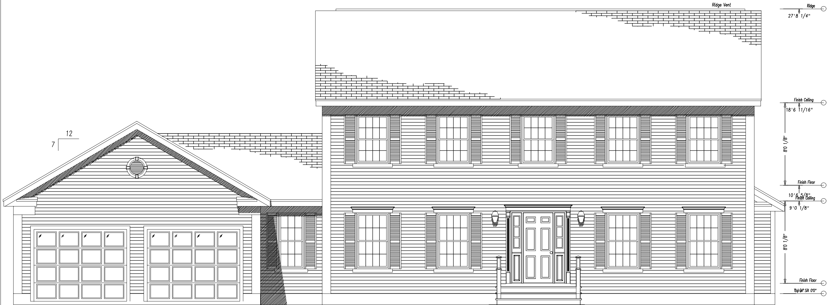
Front Elevation Scale: 3/16" = 1'0"

NOTE: Architectural details shown may not be included as standard in order as priced Garages, Decks, Railings, Exterior Stairs are all optional for all homes. Window Shutters - Optional on all Homes Overhead Doors - Not Available from CSI Window Grills - Option Kneewall Window & Siding Packages are optional (Split Level, Tri Level) All kneewall framing & sheathing by GC