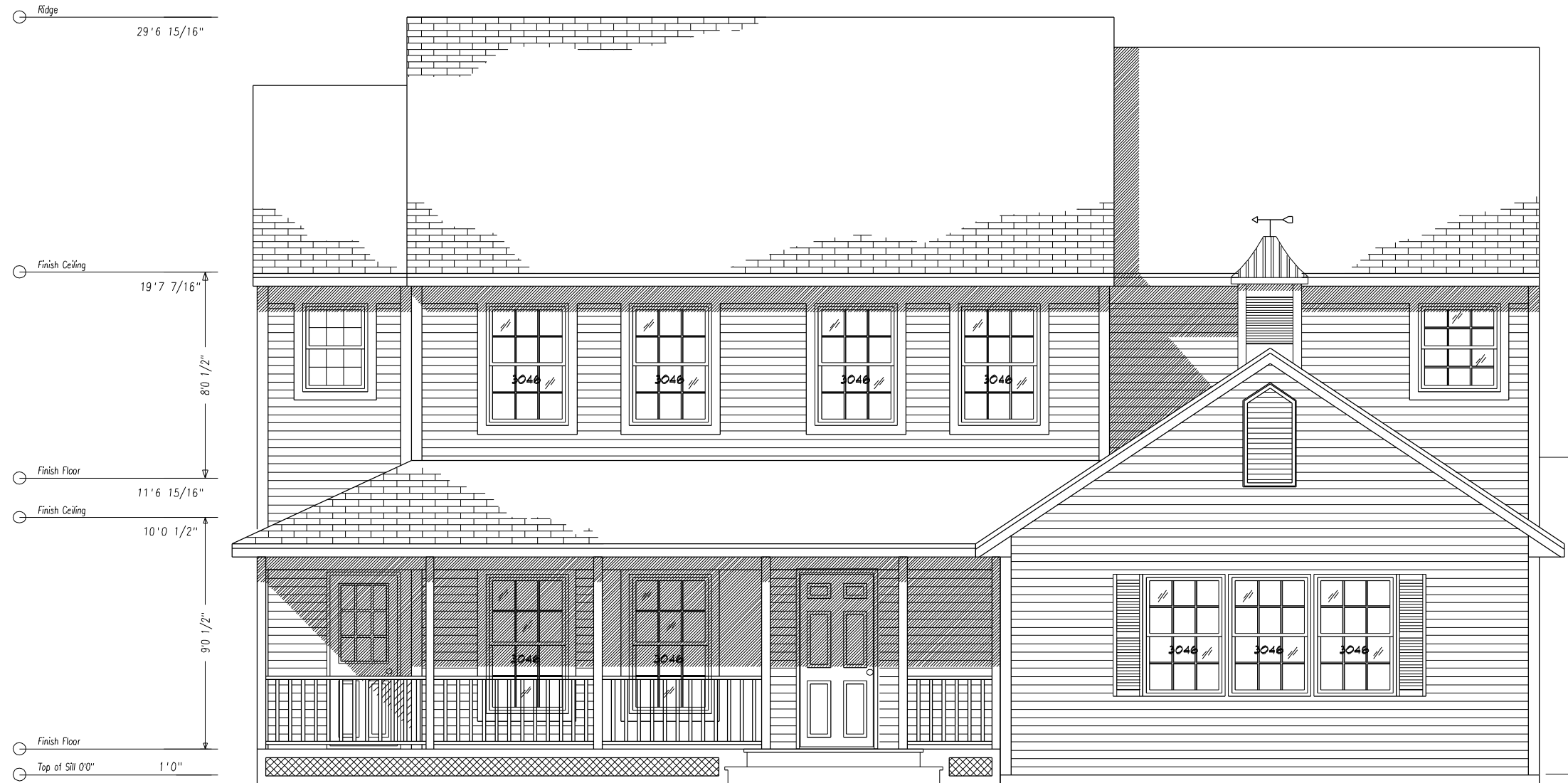
Front Elevation Scale: 3/16" = 1'0"

Garages, Decks, Railings, Exterior Stairs are all optional for all homes. Window Shutters - Optional on all Homes Overhead Doors - Not Available from CSI Window Grills - Optional Kneewall Window & Siding Packages are optional (Split Level, Tri Level) All kneewall framing & sheathing by GC Gable End Overhangs - Optional on all Style Homes