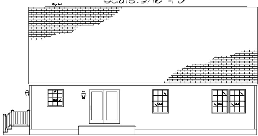
Rear Elevation Scale: 3/32" = 1'0"