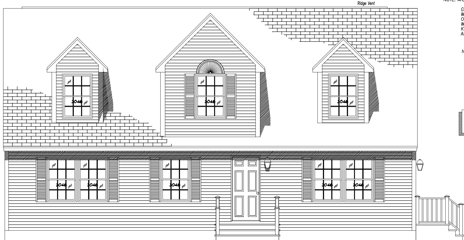
Front Elevation Scale: 3/16" = 1'0"