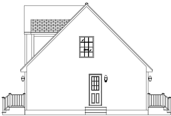
Right Elevation Scale: 3/32" = 1'0"

NOTE: Architectural details shown may not be included as standard in order as priced. Garages, Decks, Railings, Exterior Stairs are all optional for all homes. Window Shutters - Optional on all Homes. Overhead Doors - Not Available from CSI. Window Grills - Option. Kneewall Window & Siding Packages are optional (Split Level, Tri Level). All kneewall framing & sheathing by GC.